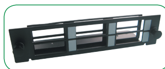
6 Port SC Duplex/LC Quad Plate