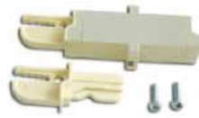
E2000 Multimode Simplex Adapter