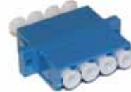
LC Singlemode Quad Adapter