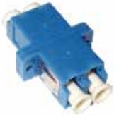
LC Singlemode Duplex Adapter