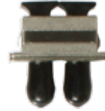
SC-ST Multimode Duplex Adapter